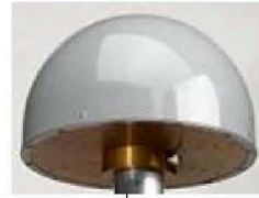
CUTA0 (TRM 59800.00 SCIS)