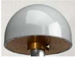
CUTB0 (TRM 59800.00 SCIS)