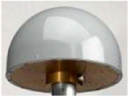
CUTC0 (TRM 59800.00 SCIS)